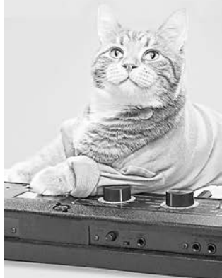
Amazing stories start in shelters and rescues. Adopt today to start yours.