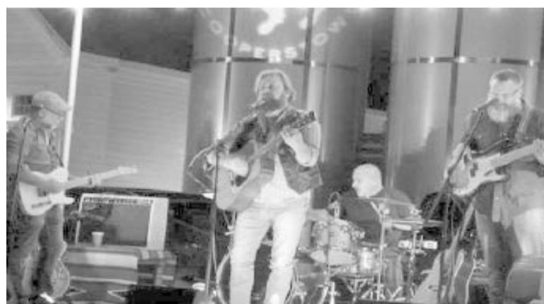
Performance by THE HOP CITY HELLCATS