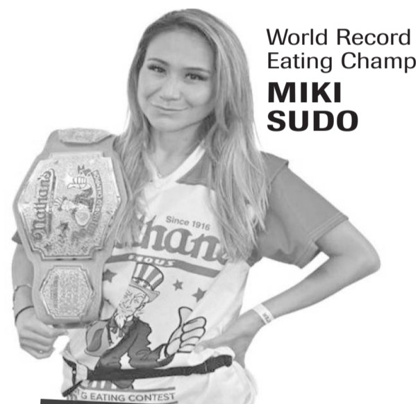
World Record Eating Champ MIKI SUDO

VIP Ticket of $39.99 includes admission to the building starting at 2pm