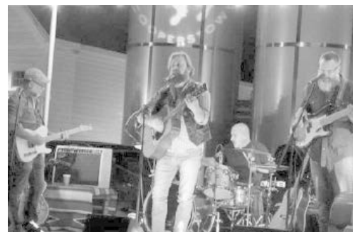
Performance by THE HOP CITY HELLCATS